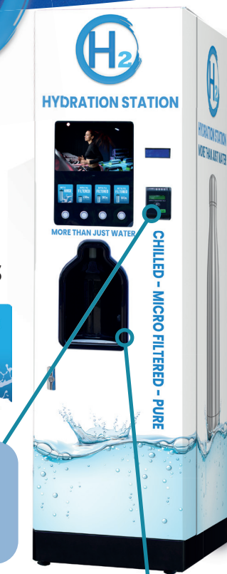
Shown with standard graphics

Supports free-vend and most cashless payment systems.